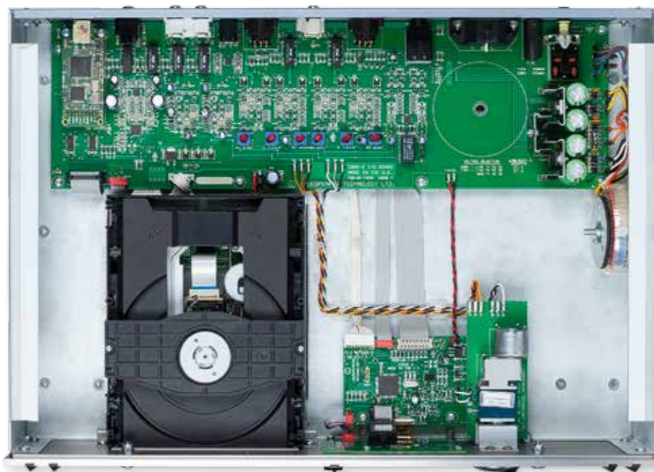
RIGHT: The CD transport [lower left] is sourced from TEAC, the USB input board [top left] is powered by an Atmel processor and the (balanced) analogue stage [top] features a premium AKM 'Velvet Sound' AK4490 DAC

The output of the DAC stage, and the three analogue inputs (one of which is of higher sensitivity, and provided on a 3.5mm stereo socket instead of a pair of RCA phonos) feed into a fully-balanced preamp stage on the main board stretching the width of the rear of the housing. Even the 6.35mm headphone socket, driven by its own amplifier, is on the rear panel to keep signal paths short, and the front panel controls are 'fly by wire' rather than being coupled mechanically to the audio board.