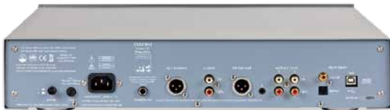
ABOVE: Digital inputs are covered by DSD-compatible USB-B and S/PDIF on coax and Toslink optical, with two sets of line-level analogue inputs on RCAs, alongside a 6.35mm headphone socket, balanced (XLR) and single-ended (RCA) preamp outputs

amazing how its 'nothingness' can prove highly addictive! You could pay a lot more for a CD player, DAC and preamp and still find the components imposing something of themselves on the sound. That this (relatively) affordable combination offers so much and yet adds or removes so little is a major achievement by ATC's engineers.